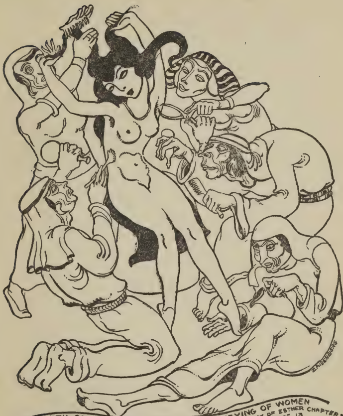
AND WITH OTHER THINGS FOR THE PURIFYING OF WOMEN BOOK OF ESTHER CHAPTER 2 VERSE 13